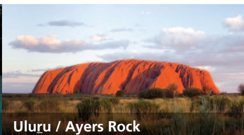
Uluru / Ayers Rock